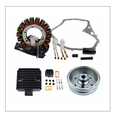
KIT FLYWHEEL + FLYWHEEL PULLER + STATOR + VOLTAGE REGULATOR RECTIFIER

Arctic cat (all) > RM23024 Suzuki (all) > RM23023