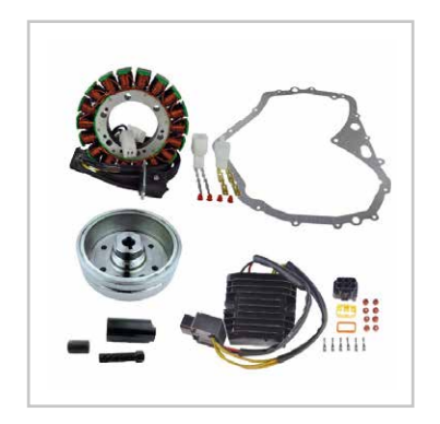
KIT FLYWHEEL + FLYWHEEL PULLER + STATOR + MOSFET REGULATOR RECTIFIER

Arctic cat (all) > RM23035 Suzuki (all) > RM23035 Arctic cat (man.) > RM23027 Suzuki (man.) > RM23022