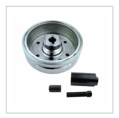
KIT FLYWHEEL + FLYWHEEL PULLER

Arctic cat (all) > RM23024 Suzuki (all) > RM23023